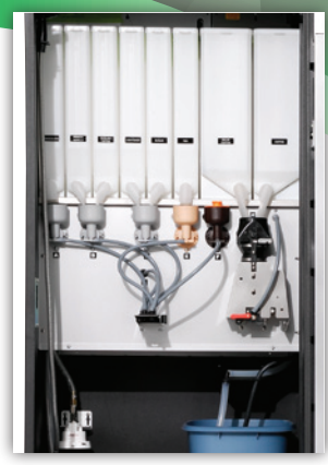
State-Of-The-Art Brewing System Simple brewing system and filtering ensure a high quality, consistent drink (No Filter Paper Required)