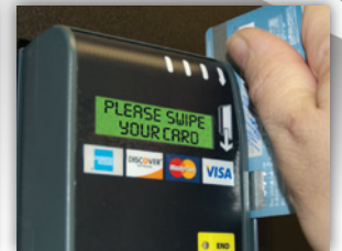
Credit/Debit card reader options.