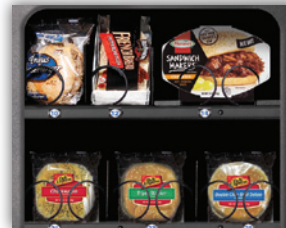
Vends all types of frozen meals, sandwiches & deserts.